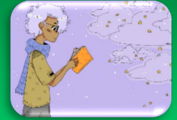
3 rd place winner

To keep people engaged with their libraries following physical closures, Parkland's Advocacy Committee held a library card design contest in July. We received over 100 submissions from all ages across the whole region. The Advocacy Committee chose three winning designs through online, anonymized voting. These new cards were distributed to member libraries at the end of September.