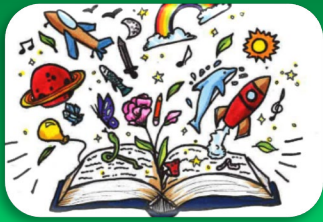
1st place winner

To keep people engaged with their libraries following physical closures, Parkland's Advocacy Committee held a library card design contest in July. We received over 100 submissions from all ages across the whole region. The Advocacy Committee chose three winning designs through online, anonymized voting. These new cards were distributed to member libraries at the end of September.